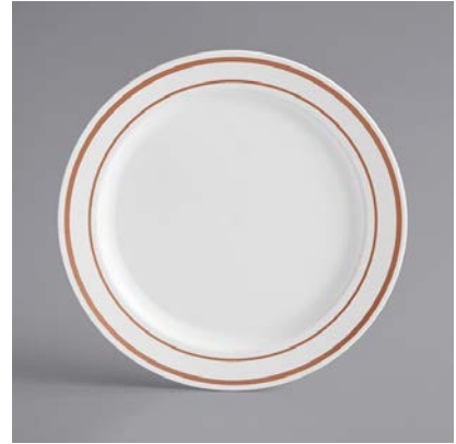
Rose Gold Copper Band