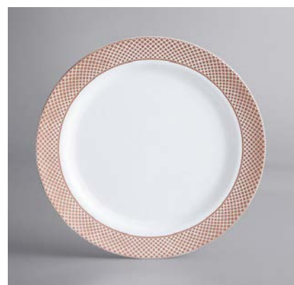
Rose Gold Lattice